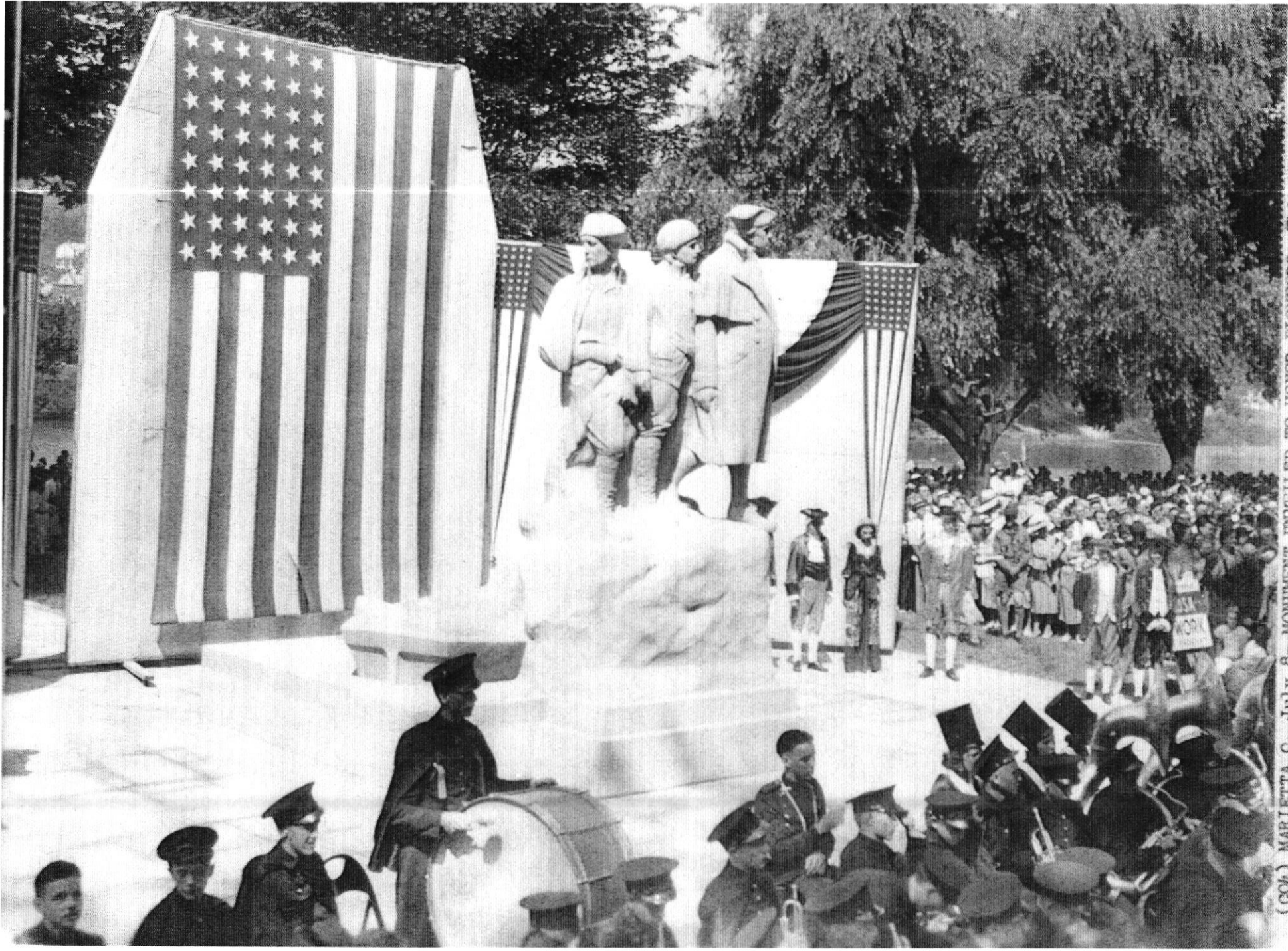
(CO4) MARIETTA, O., July 8.--MONUMENT UNVEILED TO HONOR PIONEERS--This was the scene here today after this monument honoring the memory of Northwest Settlement pioneers had been unveiled in connection with the ceremonies planned by President Roosevelt's speech. (far-61540grs)1938